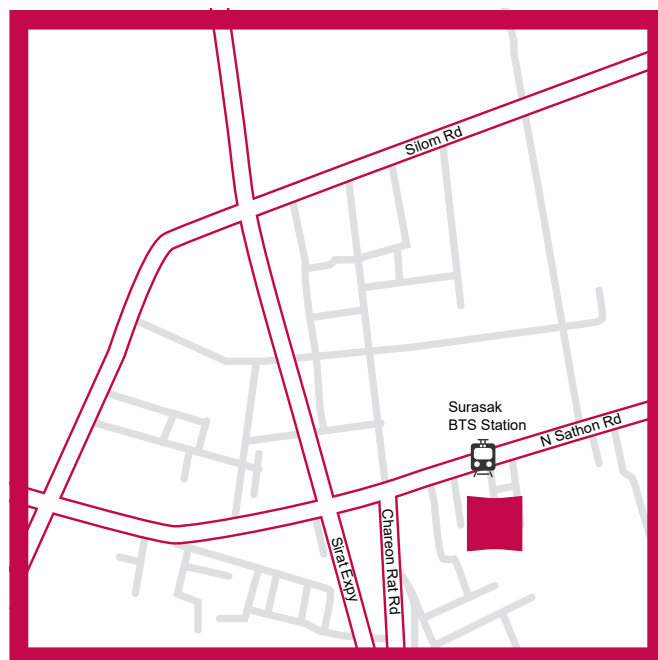
Description in detail